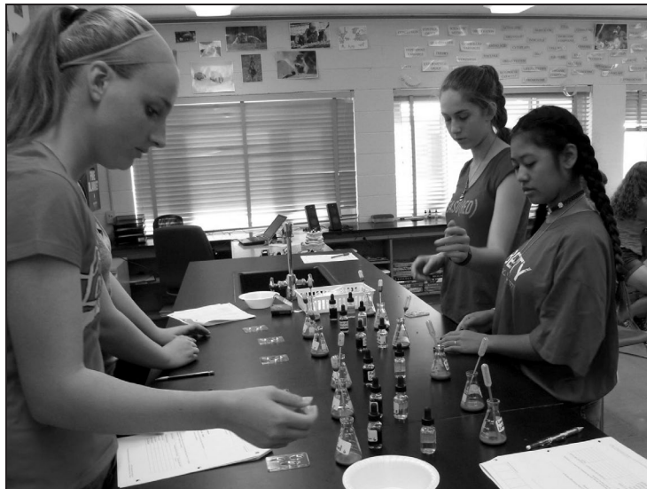
With an eye on preparing for college and career, students at the Ninth Grade Academy are taking advantage of new classes, such as Principles of Biomedical Science.

Students enrolled in the Principles of Biomedical Science class at the Ninth Grade Academy have a mystery on their hands! Designed to inspire CSI enthusiasts, the course starts by presenting students with the mysterious fictional death of Anna Garcia. The case will serve as their challenge throughout the year, prompting them to apply what they learn about the concepts of human physiology, biology, and medicine to determine the factors that led to Garcia's death. During the first few days of class, the kids visited the crime scene and started processing the evidence. During the year, they will continue to investigate the case and examine autopsy reports, investigate medical history, and explore medical treatments that might have prolonged her life! The course also includes a career exploration component where students are introduced to careers in biomedicine.