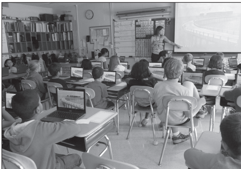
Third graders are using Chromebooks as part of their daily learning in Rush-Henrietta elementary schools. It's just one part of the district's comprehensive five-year technology plan.

Rush-Henrietta third graders have a lot to learn, like their multiplication tables, the names of all 50 states, the difference between a folktale and a fable – and how to use that brand new Chromebook! In each of our elementary schools, third graders are already getting familiar with that new technology. For example, at Crane Elementary School, students recently participated in four fast-paced Google training sessions that gave them a great start in Google Drive, Classroom, Gmail and a crash course in Google Apps for Education. At the end of the sessions, each class received a certificate of recognition, proclaiming their achievement of “Google Greatness.” We think our young learners are pretty great, too! Need more information about our instructional technology initiative in Rush-Henrietta? Just visit the district website at www.rhnet.org/technologyfaq . Thanks for your continued support!