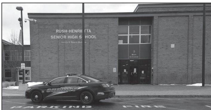
The Monroe County Sheriff's Office is making its presence known on our school campus, visiting buildings in between calls.

We are pleased to announce that the long-standing working relationship between the Rush-Henrietta Central School District and Monroe County Sheriff's Office continues to thrive. Last year, sheriff's deputies began visiting school grounds on a more frequent basis. The deputies visit our schools and district buildings in between calls to increase their visibility on campus and help provide our students with an even safer place to learn and grow. We appreciate the relationships we have built with all first responders in our community, and we thank the Monroe County Sheriff's Office for its continued efforts to keep our students and staff members safe.